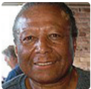
Northwest Ohio Community Shares Annual Report 2011

The July 1, 2010 – June 30, 2011 period saw a record-breaking growth in new member agencies, as five new agencies came on board in time for the 2011 (Fall) Campaign: Family Promise/IHN, Hannah's Socks, Perrysburg Symphony Chorale, Scrap4Art, and Sylvania Area Family Services. Accepted at our annual meeting on June 13, 2011, these agencies help continue and extend our mission of serving diverse locations and addressing diverse needs in arts, the environment, and families in northwest Ohio. We are especially proud that each of these agencies was founded locally by our own community members.