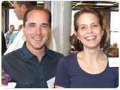
Northwest Ohio Community Shares Annual Report 2012

This year, Community Shares focused on making changes designed to promote growth for our own organization and for our member agencies. The July 1, 2011 – June 30, 2012 period saw record-breaking growth in new member agencies, as five agencies came on board for the 2011 (Fall) Campaign: Family Promise/ IHN, Hannah's Socks, Perrysburg Symphony Chorale, Scrap4Art, and Sylvania Area Family Services. With their diverse missions and service areas, we know these member agencies are helping us establish a solid foundation for expanded donor appeal and workplace access. And in keeping with our own grassroots tradition and mission, each of these agencies was founded locally by community members.